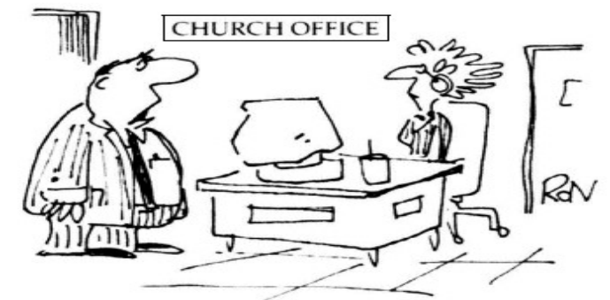
"If telemarketers call, invite them to church."

"A job is a vocation only if someone else calls you to do it for them rather than for yourself. And so our work can be a calling only if it is remained as a mission of service to something beyond merely our own interests. Thinking of work mainly as a means of self-fulfillment and self-realization slowly crushes a person." - Tim Keller