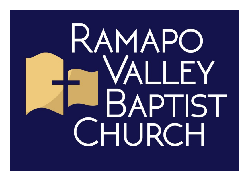
Philippians 4:13 "I can do all things through Him who strengthens me,"